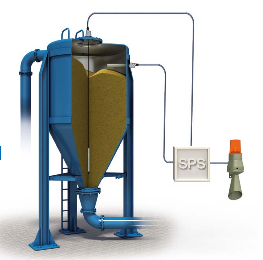
Min./max. level detection with CapFox® ENT 21. Calibration for the medium is performed via a magnetic pin in a very easy way.