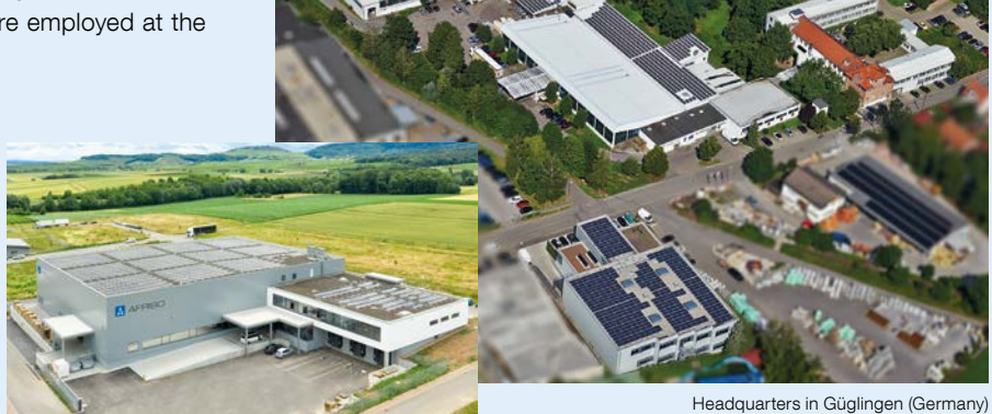
AFRISO logistics and service centre