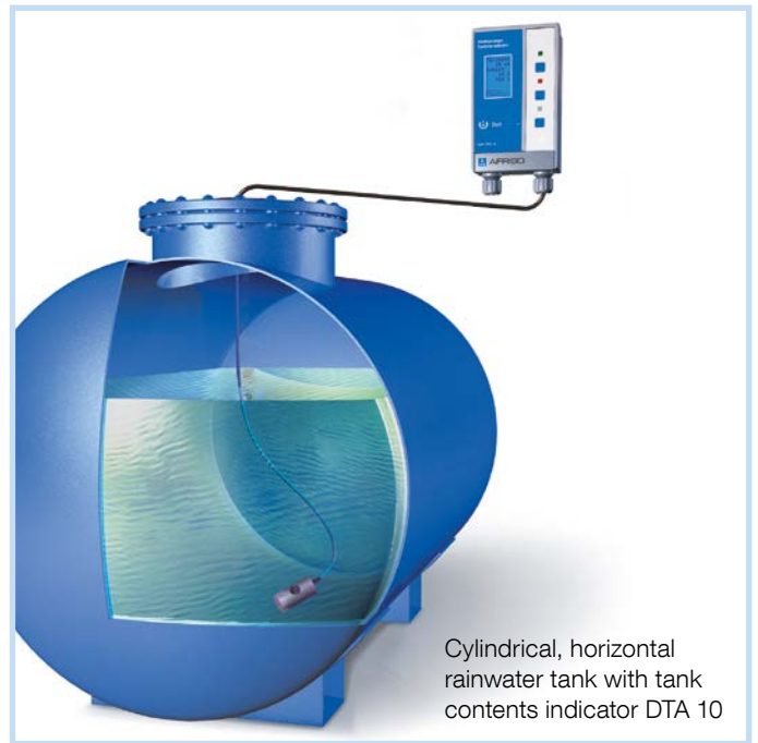
Cylindrical, horizontal rainwater tank with tank contents indicator DTA 10

The electro-pneumatic tank contents indicator DTA 10 consists of a battery-operated control unit with digital display and a measuring line. Measured values are displayed in litres, % and liquid level (cm). Simple operation and setup via three function keys. Measurements are requested by means of pressing the control key (Push-to-Read function). If the level falls below a minimum level that is freely adjustable as a percentage, the backlight of the display flashes red to indicate an alarm during the measurement. Standard tank shapes (linear, spherical, cylindrical and horizontal) are stored. Measuring line connection for hose with 4 mm inside diameter.